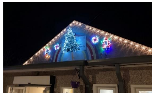
Christmas Lights on Swffryd Community Centre

ALCC provides seasonal Christmas lighting throughout the area every year. An annual budget line of £30,000 covers this central contract, and £1,800 was set aside for the electricity costs this year. An additional £1,500 was also budgeted for additional lighting in Abertillery town centre, on Somerset Street. ALCC also gives yearly grants to local communities for their own lighting – these go to Llanhilleth TRA and the Community Centres in Swffryd, Brynithel and Bournville for the provision of Christmas lights, and total up to £7,500.