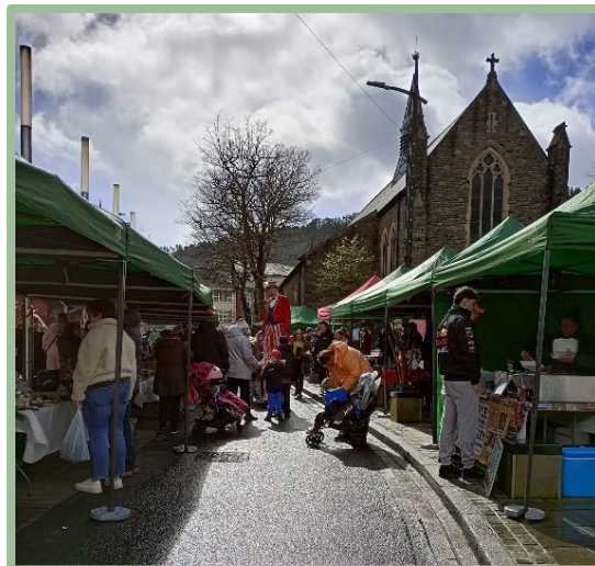
Springfest stalls