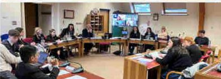
Photos from the Abertillery Learning Community Newsletter (8 th March 2024)