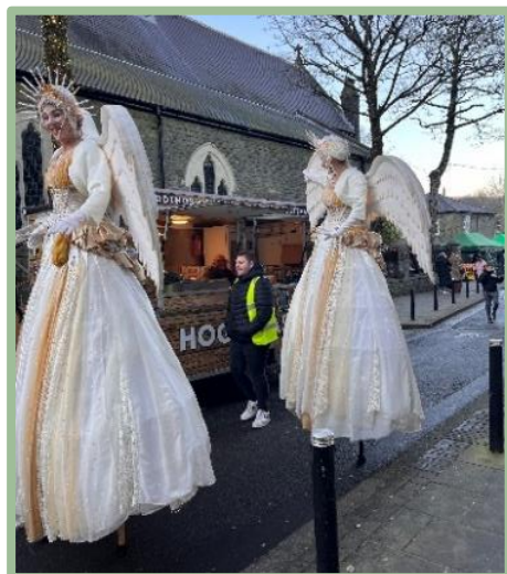
Stilt-walkers at Winterfest

ALCC provides grant funding to Ffrindiau Tyleri to help them host a series of town centre events throughout the year. These include Winterfest, Springfest, Aberfest and a Halloween event. The events include a variety of entertainment, including live music and mascots, food vans and shopping stalls. Each event offers something different, and they are attended by thousands each year. The Clerks also participated in a Springfest litter pick in Abertillery town centre. This was organised by Ffrindiau Tyleri and in collaboration with the Abertillery Learning Community and the litter picking team at Blaenau Gwent County Borough Council. A total of 62 bags of rubbish were filled over the course of 90 minutes.