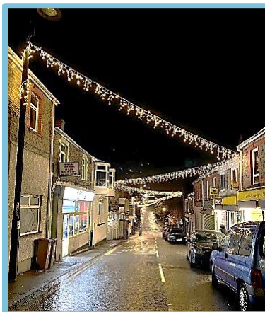
Photo of Llanhilleth High Street